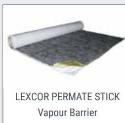
LEXCOR PERMATE STICK Vapour Barrier